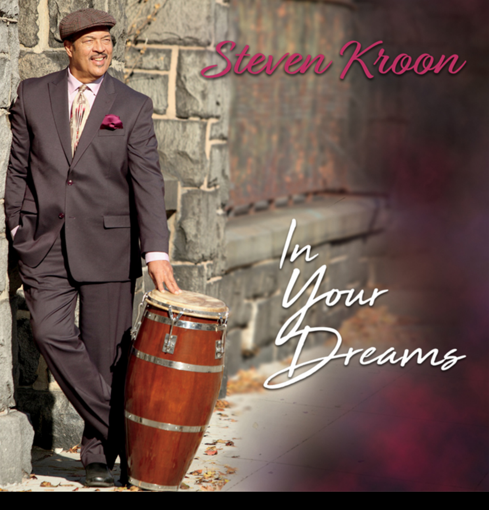
LATEST RELEASE 2018