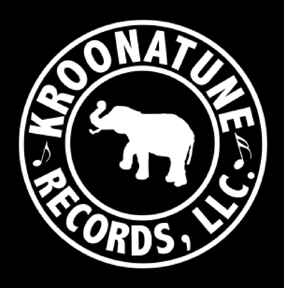
Copyright KROONATUNE RECORDS, LLC © 2018. All Rights Reserved.